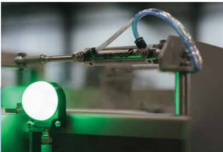
Individual Operator Lights