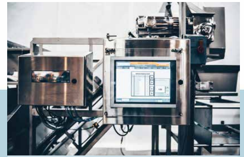
B&R® Automation Control