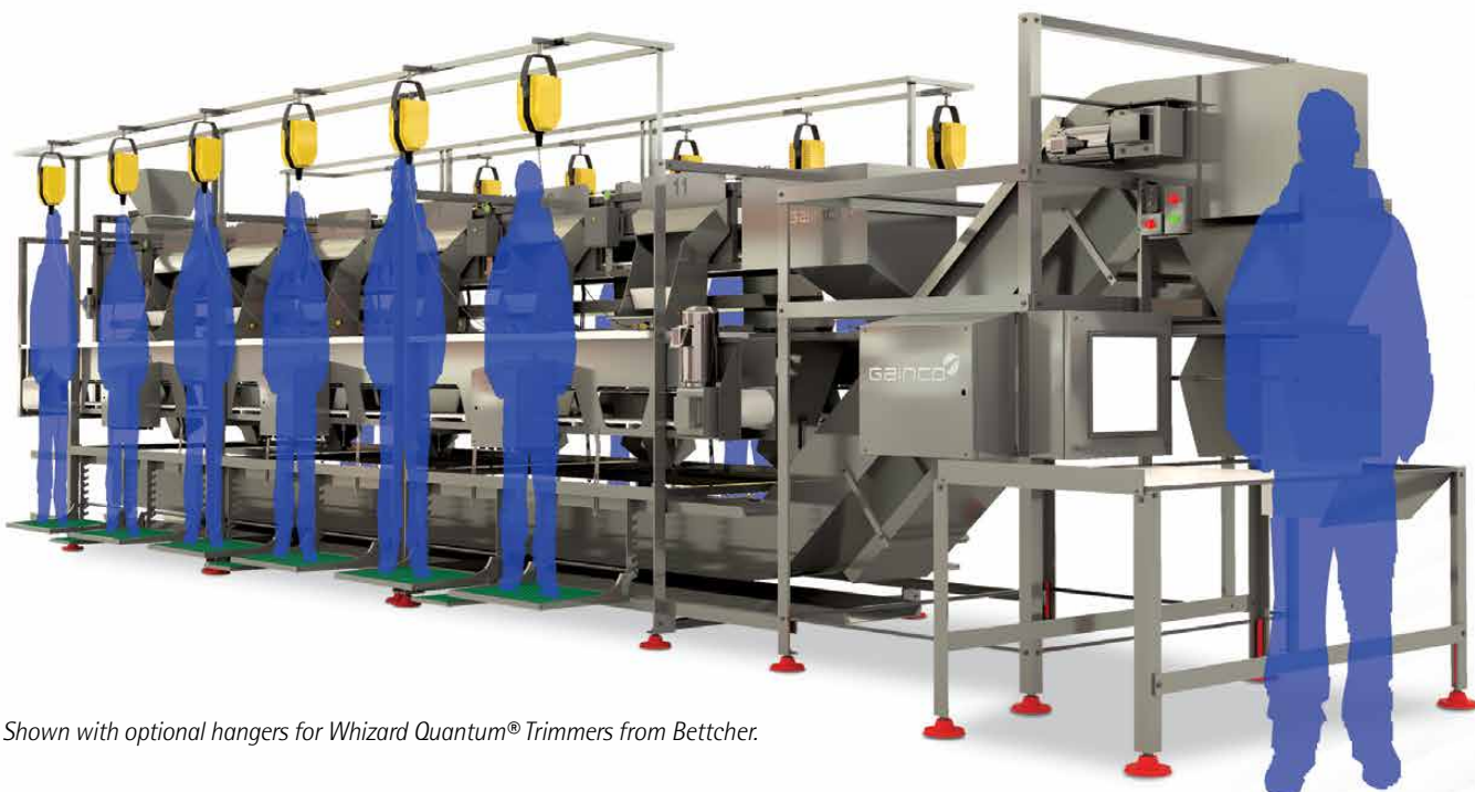
Shown with optional hangers for Whizard Quantum® Trimmers from Bettcher.