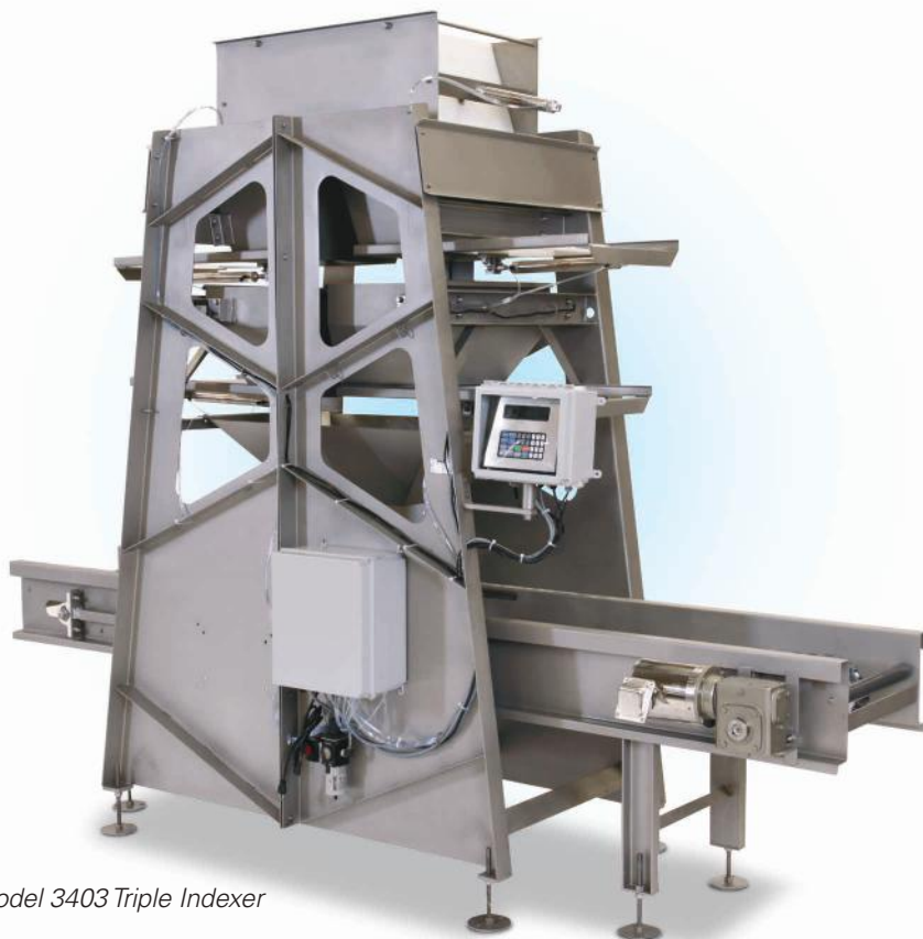
Model 3403 Triple Indexer

AccuFill® Indexing Bulking Systems from Cantrell•Gainco deliver automation of bulk packing applications that are highly effective and have short payback periods.