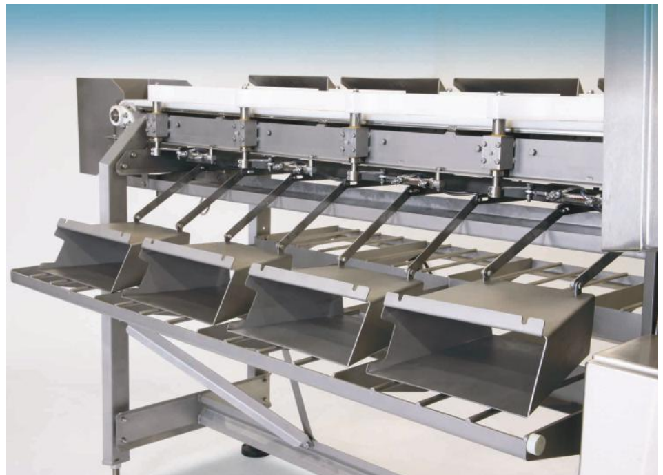
Chutes on AccuSizer™ belt graders utilize captive hinges for complete access to the belt frame, improving sanitation and making set-up and pre-op inspections a breeze.

The equipment can also process other meat products such as hams.